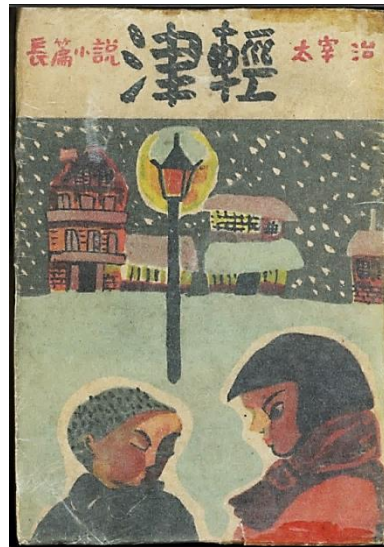
Second Edition Tsugaru , Maeda Shuppansha 前田出版社, 1946

The second printing of Tsugaru has a very different overall appearance just on the cover alone. On the top it is written “長篇小説 津軽 太宰治” meaning “Full-length Novel Tsugaru Dazai Osamu”. This establishment of Tsugaru as a full-length novel has been a very interesting point of debate in previous research as seen earlier. The picture which dominates the center of the cover, although attractive, does not