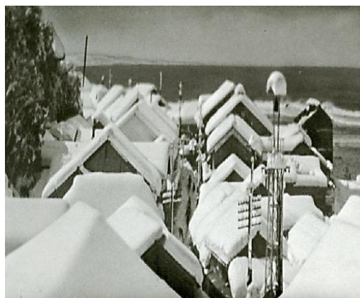
Figure 4: Teikō Shiotani Akasaki Sekkei (photograph) 1932

By the 1930s, the popularity of pictorialism was waning, and a new avant-garde style known as Shinkō Shashin was being pursued by artistic photographers. However, Shōji Ueda (1913–2000), another photographer who spent most of his life living in Tottori, decided not to follow this new trend, but rather create his own original style which became known as Enshutsu Shashin (Performative Photography). The first photo Ueda ever shot was of the sands of the shoreline near his home in Sakaiminato City. 45 While many photographers from Tottori have chosen the sand in Tottori (especially the Tottori Sand Dunes) as the subject matter for their work, in the case of Ueda, the sands of Tottori have been the primary setting for some of his most famous works including Shōjo Yontai (1939) and Kogitsune Tōjō (1948) (Fig. 5).