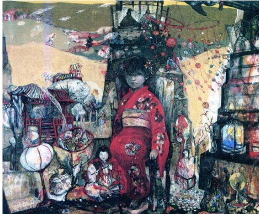
Figure 8: Mana Satō Soshun (oil painting) 2006

perceived from life in Tokyo was the lesser degree of artificial lighting used at night in Tottori. 57 Since there were no abundant street lighting and neon signs like Tokyo, the experience of night in Tottori was much darker. In addition to the Nagashibina motifs, Satō's paintings can also be understood as a representation of this experience.