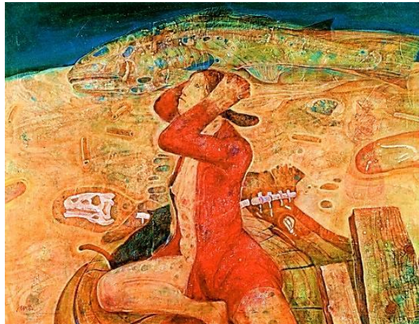
Figure 7: Mamoru Sumi Kawaita Umi (oil painting) 1995

Following the fishermen series which Sumi continued throughout the 70s and 80s, in the 1990s he began a new series consisting of a dystopic future where the sea had dried up, leaving only a barren landscape. Works from the waterless sea series such as Kawaita Umi (1995) (Fig. 7) depict scenes in broad daylight, but the images consist of only one woman sitting amongst garbage and dried carcasses of dead sea creatures scattered across a parched seafloor. Whereas Sumi's earlier work document a past reality which has all but disappeared due to advances in industry, the waterless sea series portrays a fictional world which may become a future reality if we are not careful of the ways we engage with the environment.