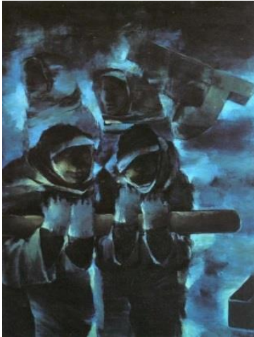
Figure 6: Mamoru Sumi Kagura-san (oil painting) 1977

Though the fishermen series is dark in terms of its use of color and the time of day being depicted, it is also burgeoning with life, with the representation of fishermen and merchants hard at work together handling fresh sea produce.