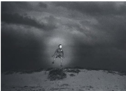
Figure 5: Shōji Ueda Kogitsune Tōjō (photograph) 1948

to something more than just the fact that the prefecture is home to one of the largest sand dunes in Japan. As the novelist Kōbō Abe states in his essay “Sabaku no Shisō” (1965), sand suggests the notion of remoteness, and the quantity of sand necessarily effects the caliber of that remoteness. 46 For example, a large desert connotes the idea of remoteness much more strongly than a small sand box in a park. In line with this logic, the frequent use of sand in Tottori as the subject matter of photography equates to a quantitative increase of sand at the level of representation, which in turn, emphasizes the remoteness attributed to the region.