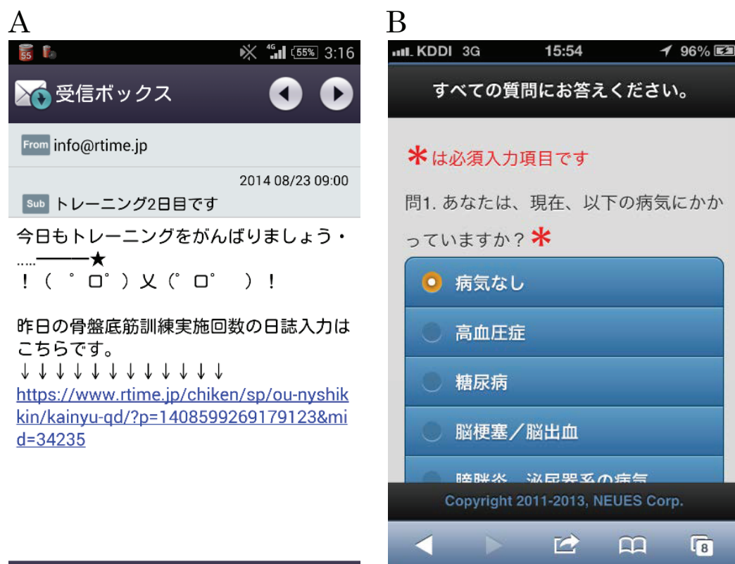
Figure 1 Screenshots of PFMT reminder e-mail and input screen for participant characteristics. (A) Screenshot of PFMT reminder e-mail. (B) Screenshot of input screen for participant characteristics.