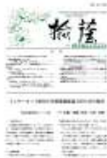
Library bulletin, YUIN

"If our article is read by photoelectronic researchers or researchers engaged in the applied development, I am very pleased. Anyway, I am surprised at the coincidence that our article was posted on HUSCAP as the 20,000th article, even though there are a lot of papers in HUSCAP."