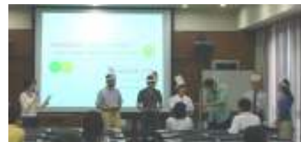
A Skit about the relationships among EJ, University and Researchers

During Qs and As period after the briefing sessions, we got frank opinions about HUSCAP from researchers. The issues of "differences between publisher version and author version" and "concern that various version of articles go into circulation" became popular topics of conversation. Interchanges like these generate a new strategy to participate for authors. The result of the questionnaire showed almost all researchers have known about "HUSCAP" and they have seen the posters of HUSCAP in the campus.