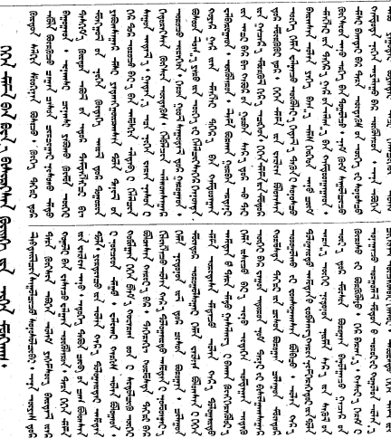
... (transcription of the caption for the photograph) ...