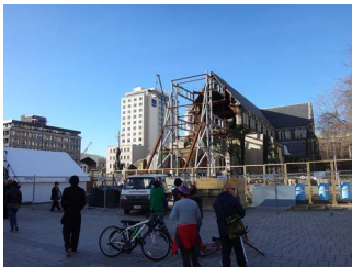
PHOTO 6. People visiting the CBD, which was released to the public on June 30 th , 2013. It had been designated as a no-trespassing area after the onset of the earthquake on February 22 nd , 2011. (Photo on July 1 st , 2013)