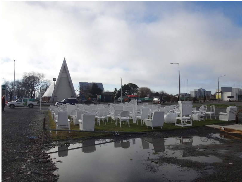
PHOTO 1. Memorial for the 2011 Canterbury earthquake victims. All the white chairs vary in its shape and design, representing 185 victims, including a baby cradle. White triangle building behind is the backside of the transitional cathedral made of cardboard tubes designed by Mr Shigeru Ban.