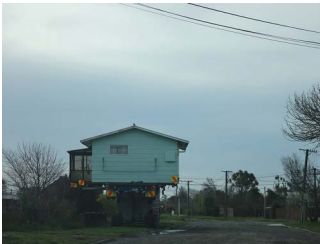
PHOTO 13. A house on liquefying land, which has been elevated for reuse. It will be returned to its original spot after construction of the ground base, or will be relocated if the construction doesn't improve the ground (Kaiapoi, 2013)