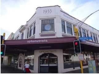
PHOTO 24. A street view of Napier, which was reconstructed in the art deco style. This style was in fashion at the time, after suffering the devastating Hawkes Bay Earthquake in February 3 rd , 1931. (New Zealand, North Island, August 2013)