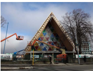
PHOTO 26. Transitional cathedral made of cardboard tubes designed by Mr. Shigeru Ban. This was built upon the collapse of the original cathedral due to the earthquake. Many volunteers helped in the construction (Photo from July, 2013. Construction completed in the next month)