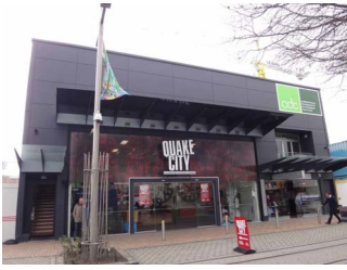
PHOTO 15. Disaster Museum “The Quake City” (August 2014). Located on the corner of the temporary shopping area “Re: START” (See page 315) in the CBD, which was badly damaged.