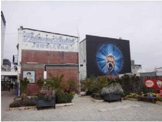
PHOTO 22. Performing Arts Precinct. A ballerina is posted on the right wall (August, 2014).