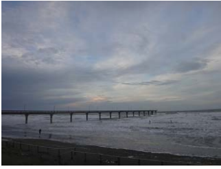
PHOTO 27. New Brighton, badly damaged due to liquefaction. Area where many sea lovers live. The younger generation returned for surfing (August, 2013). In September of 2015, a tsunami after the Chile earthquake was observed just like the one in Japan.