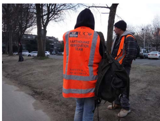
PHOTO 8. Construction worker wearing a fluorescent jacket saying “EARTHQUAKE REMEDIATION TEAM.” At the bus stop in front of Canterbury University, homeward bound after a day’s work.