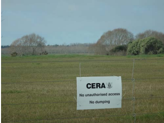
PHOTO 12. Restricted entry and prohibition of illegal dumping of garbage sign by CERA. Many found around abandoned houses (Kaiapoi, 2013)