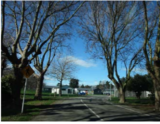
PHOTO 9. Temporary housing occupying Linwood park.