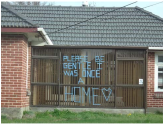
PHOTO 21. A house became unliveable due to liquefaction after the earthquake. A message “Please be gentle, I was once a Home ♡” is on the wall. (August, 2013)