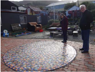
PHOTO 29. On the ground is mosaic art which gives hope towards reconstruction, made by children to depict people holding hands. Full of prayers of rehabilitation are woven into the work of art, which is made out of broken dishware and was created by primary school children. (August, 2013)

* Mosaic made of broken potteries is to cherish their memories of the lost and to create the rebirth of the broken/lost pieces. In the areas affected by the 2009 Victorian Bushfires in Australia, many colourful mosaic mail boxes were made of pieces of broken potteries to cherish the memory and to wish the rebirth.