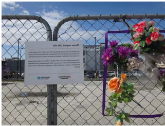
PHOTO 4. Vacant lot after the collapse of the CTV building, which resulted in many victims. A sign says “Please respect this site.” City tour buses stop in front of this sign when disaster tourism was included within their courses.