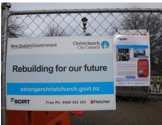
PHOTO 11. Rebuilding for our future: A sign board by the construction company Fletcher calls for this slogan all around the city.