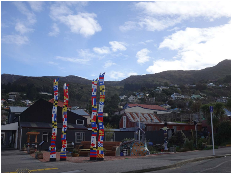
PHOTO 2. Art sculpture built on the vacant lot of collapsed buildings on Main Street in the port city of Lyttelton. On the ground is mosaic art which gives hope towards reconstruction, made by children to depict people holding hands. Benches have been installed in the hope that this location will be a place of gathering and relaxation for people despite its temporary status (Christchurch city, August 2014).

This chapter will take up the Canterbury earthquake, which occurred in New Zealand, as an example for discussing the creative reconstruction that can be observed there* 1 . Taking a bird's eye view, in advance, of New Zealand society's response to the earthquake, I can summarize its main characteristics into the following 3 points. Firstly, the self-help-centric solutions based on the enhancing of insurance have been addressed (provided that the situation is not perfectly idealistic due to the fact that the insurance has not been paid steadily, as described later, and also due to other reasons). Secondly, in conjunction with the aforementioned issue, mobility of the population is high and many people have moved out of the affected area after the disaster. Thirdly, reconstructions using works of art have been attempted at the most disaster-stricken