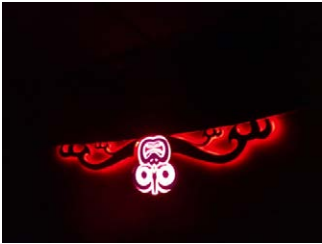
PHOTO 28. “Maori’s God of earthquake,” which was exhibited in the earthquake disaster museum (photo in page 313 in the original Japanese book: See Photo 15 in this paper.) (August, 2013)