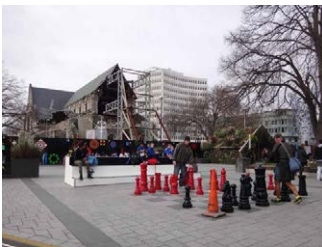
PHOTO 23. People in the plaza enjoying chess by moving giant pieces. Behind them is the affected Christchurch cathedral (August, 2014)