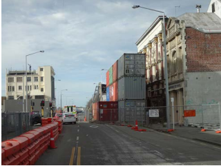
PHOTO 10. CBD of Christchurch. Piled up containers are for preventing old buildings from causing an accident due to collapsing.