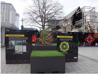
PHOTO 16. Colourful signs installed in a plaza in front of the affected Christchurch cathedral. One month since the “Keep Out” order was dissolved, this plaza has an atmosphere of an open-air ceremonial museum. (August 2013)