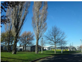
PHOTO 14. Canterbury University's temporary school buildings, Dovedale Village (July 2013)