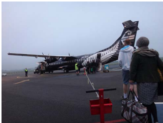
PHOTO 7. Those who are leaving Wellington from the airport by an airplane bound for Christchurch after the Wellington earthquake on August 16 th in 2013. New Zealanders themselves acknowledged the transient population.