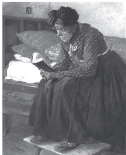
Fig.1 Adolf Hölzel, Hausandacht [Domestic Devotions], ca 1890. Oil on canvas, 40×32cm, Neue Pinakothek Munich

However, Hölzel's painting style was already moving into a new phase, and it was in a different direction from the expectations of the academy. One of the Circle members Willi Baumeister (1889-1955) looked back: "Once Adolf Hölzel was called to the academy from the gray Dachau, he slowly took off his sheep fur coat in the course of his tenure and became a wolf. Otherwise he wouldn't be appointed." 7)