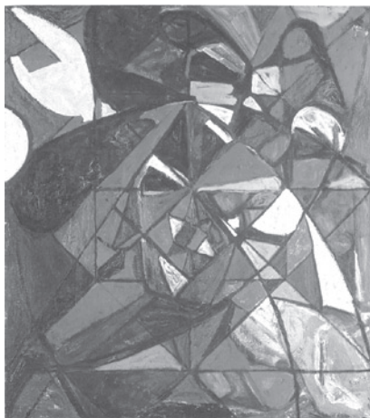
Fig.3 Adolf Hölzel, Große Abstraktion [Great Abstraction], 1916, Oil on canvas, 125×110cm, Staatsgalerie Stuttgart

These seven contrasts remained Itten's most fundamental concept, and brought to the Bauhaus and beyond. However, as discussed, these ideas had been influenced by Hölzel. While the concept of contrast was not originally from Hölzel, Itten referenced von Bezold's quotation and Chevreul's, indicating Hölzel's contribution to color theory was that he had reconsidered various scientific color studies from an artist's point of view. Therefore, Hölzel's concept became firm and stable through Itten as his spokesman.