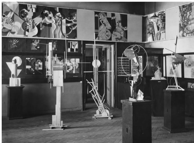
Figure 1: Exhibition in the branch of the School for Arts and Crafts in the Fichtgasse June to September 1924

Viennese Kineticism (hereafter 'Kineticism') was not a consciously organised group, but a trend that emerged in the Ornamental Studies class of the School for Arts and Crafts attached to the Imperial Royal Austrian Museum of Art and Industry in Vienna (Figure 1). The group's mentor was art pedagogue Franz Cizek, and his students in their late teens to around 20 years of age were involved in the execution of the works.